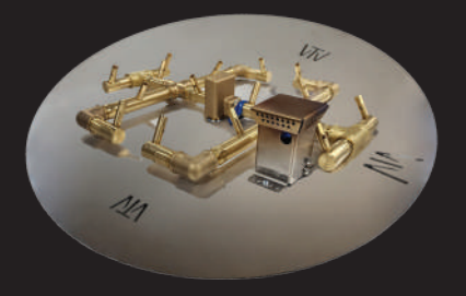
PLATE WITH IGNITION KNOCKOUTS