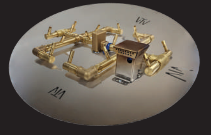
PLATE WITH IGNITION KNOCKOUTS