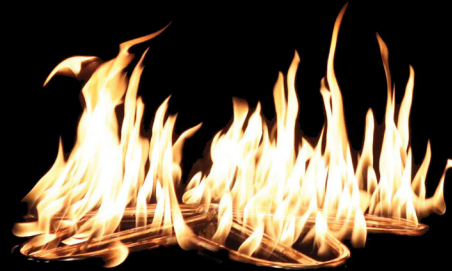
Competitor Burner with 180K BTUs