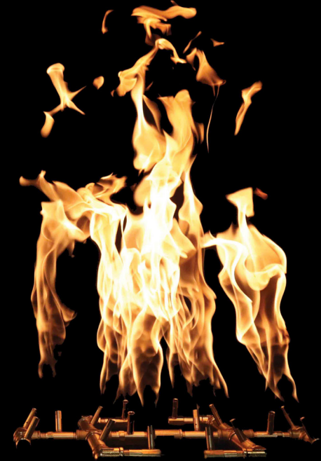
CFB180 Original CROSSFIRE® Brass Burner