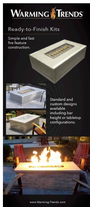
Panel 4 Features Ready-to-Finish Kits