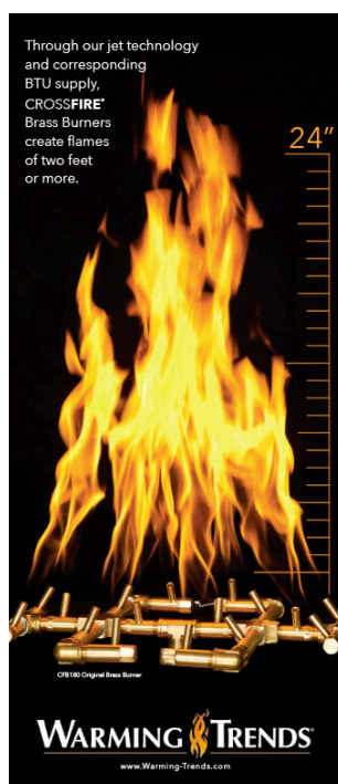
Panel 1 Comes pre-selected with display.

Floor Displays include two pre-selected panels and choice of two more.