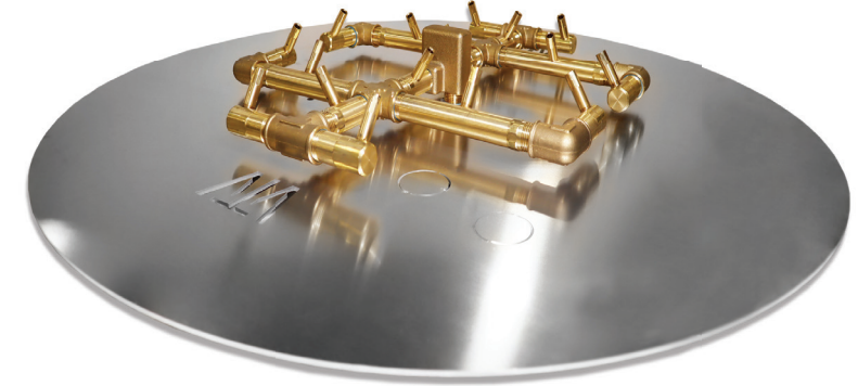
CFB180 on Circular Plate