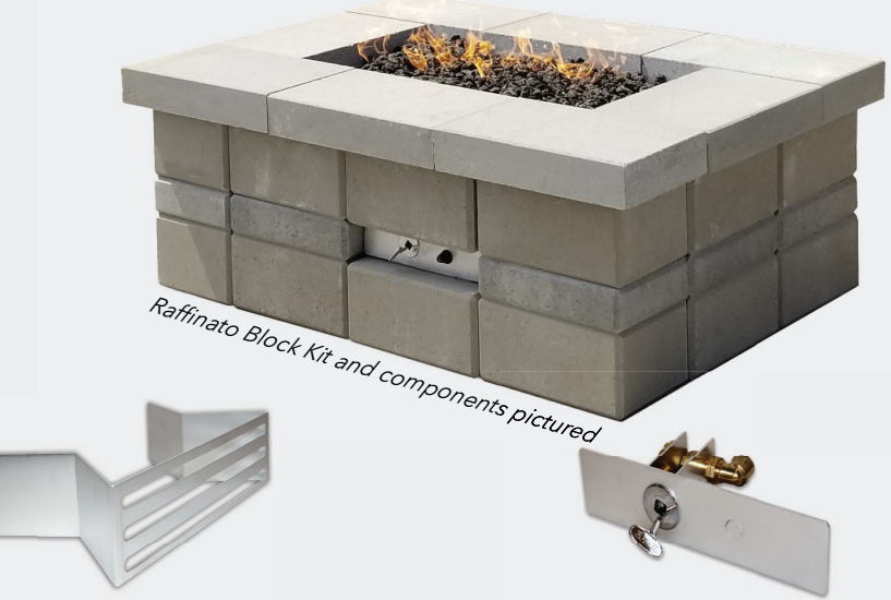
Vents are sized perfectly to replace a block and support the block above.