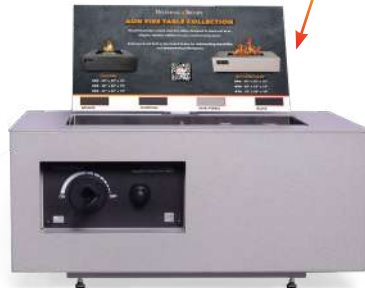
SAND PEBBLE 104692SND (NG) 104628SND (LP)