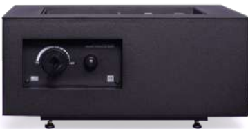
BLACK 104692BLK (NG) 104628BLK (LP)