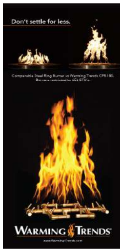
Preselected with Display