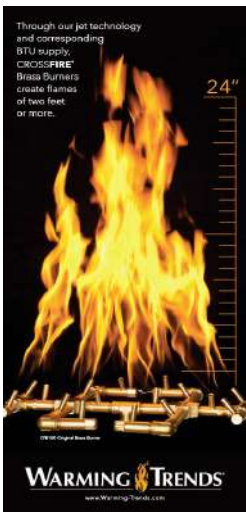
Preselected with Display

Floor Displays include two preselected panels and your choice of two additional panels.