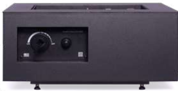
CHARCOAL 104692GRY (NG) 104628GRY (LP)

COMPLIMENTARY MAGNETIC SELL SHEET AND COVER STAND