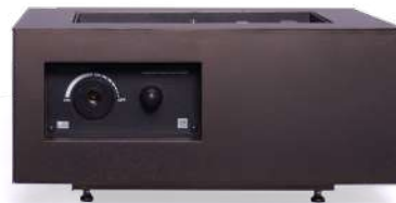
BRONZE 104692BNZ (NG) 104628BNZ (LP)